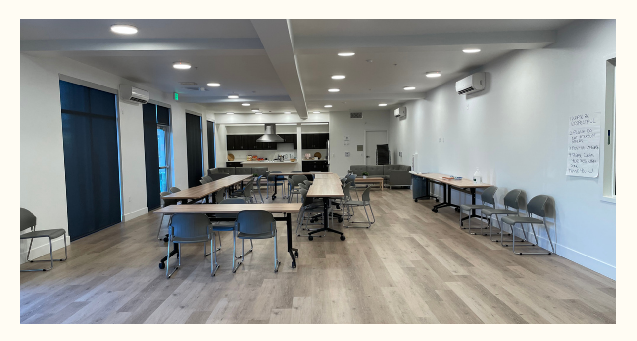
Community Room (view from entrance)